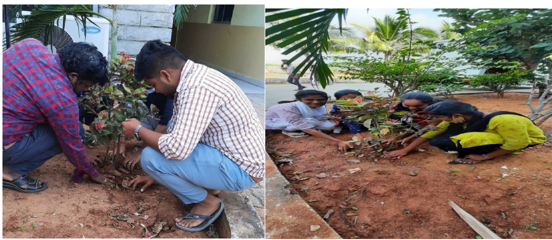
Plantation Program in the Campus