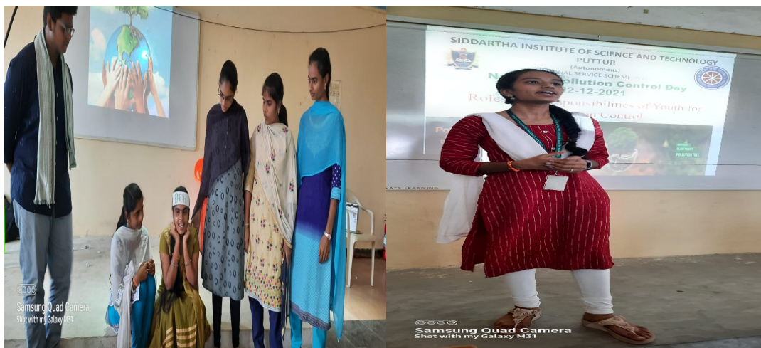
National Pollution Control Day – Presentations by students