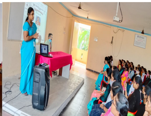
Miss Genius Program