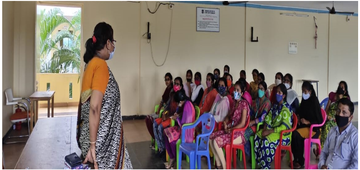
Awareness on “SwachhtaShapath” discussions with the students