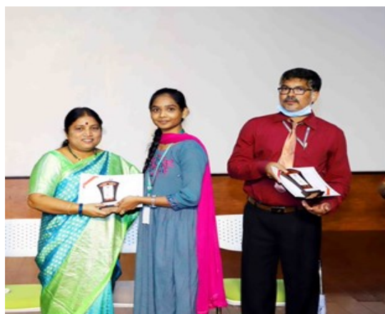
International Women.s Day-Prize Distribution