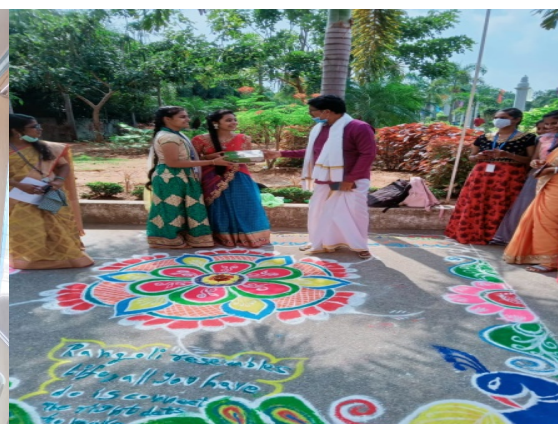
Traditional Day-Prize distribution