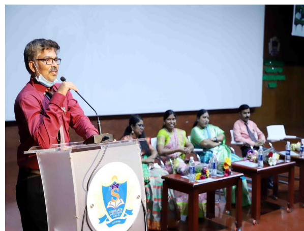
International Women's Day